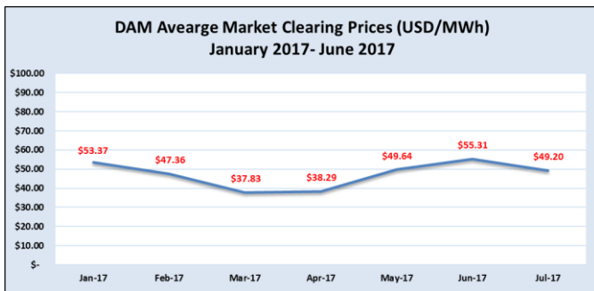
Daily Average MCP prices for the month of June 2017.

The monthly average Day Ahead market clearing price (MCP) was slightly lower during the month of July 2017 at 4.92USc/KWh when compared to the 5.531USc/KWh recorded in June 2017. Below is a summary of the daily average MCPs for the month of July 2017.