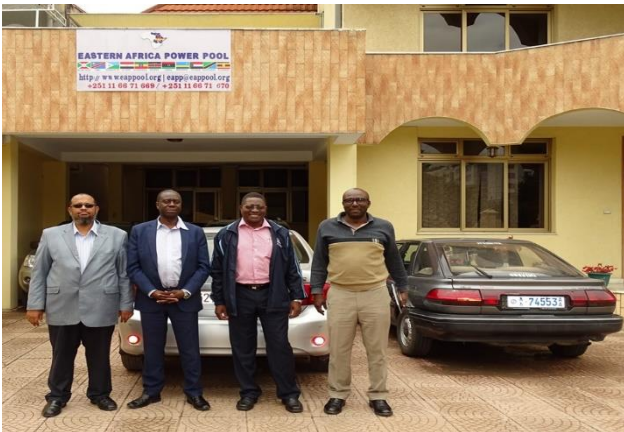
Visit by SAPP to EAPP Offices

The SAPP Coordination Centre Manager and Chief Engineer visited the EAPP Offices in Addis Ababa, Ethiopia to discuss issues of common interest on the sidelines of the APUA meetings during the month.