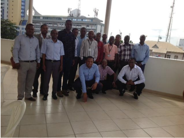
TANESCO and SAPP participants at the PDRA Workshop in Dar es Salaam, Tanzania