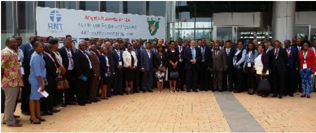
Some Delegates at the Meetings pose for a Group photo