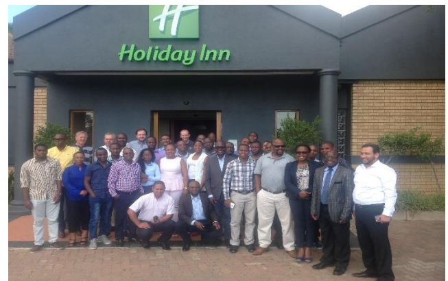
Participants pose for a photo during the SAPP-MTP certification training in Johannesburg 2-4 February 2016

A total of 28 participants from the SAPP attended the training.