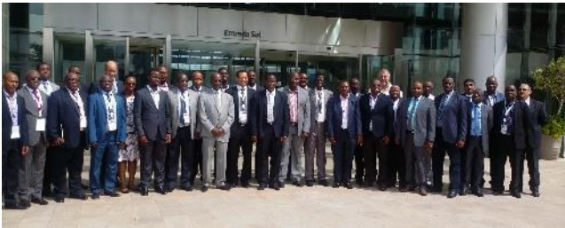
Members of the Management Committee