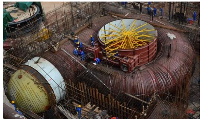
Itezhi Tezhi Power Station under Construction

The 120 MW Itezhi Tezhi hydropower project on the Kafue River in central Zambia has received Clean Development Mechanism (CDM) approval from the United Nations Framework Convention on Climate Change (UNFCCC). The power station is being built and will be operated in a joint venture between ZESCO, the national power utility in Zambia, and Tata Power of India. The project, registered under CDM project activity in September 2015, is expected to result in a reduction of about 5.9 \times 10^6 tonnes of CO 2 emissions over the ten-year credit period. [Source: The International Journal on Hydropower & Dams , Volume 23, Issue 1, 2016]