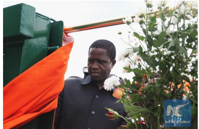
Zambian President, Edgar Lungu, unveils a nameplate at the launch ceremony of Kafue Gorge Lower Hydro-power project in Chikankata, Zambia, on 28 November 2015

contractor will also arrange debt financing from China Exim Bank and Industrial and Commercial Bank of China to fund the project. The Government of Zambia will fund 15 per cent of the cost equity, while the remaining fund will be contributed by the contractor. The power station will alleviate the power shortages not only in Zambia but also in the Southern African Power Pool. [Source: The International Journal on Hydropower & Dams , Volume 23, Issue 1, 2016]