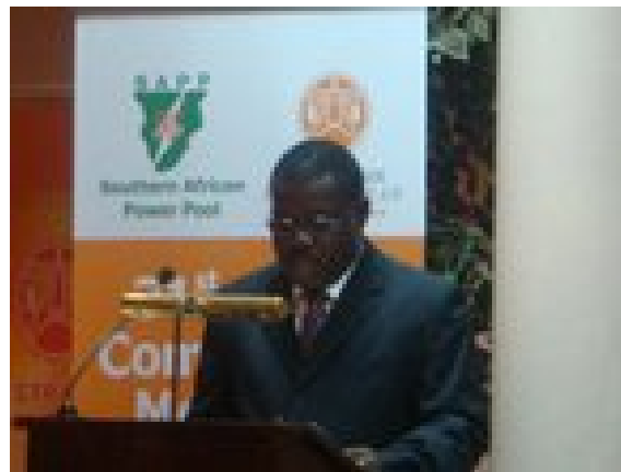
The Honourable Minister of Energy, Mozambique officially opening the 31 st SAPP meetings in Maputo.

financing gap of the identified power projects, ancillary services and transmission pricing, SAPP Pool Plan review and signing of the revised ABOM. The environmental issues discussed were the Sustainable development in SAPP and the involvement of Environmental Divisions at all stages of project planning.