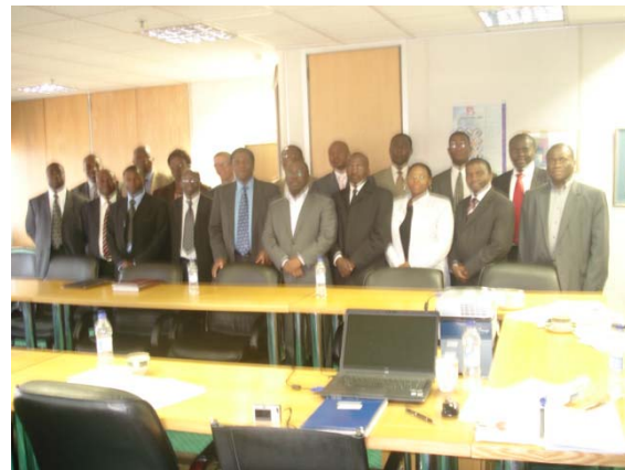
Some of the delegates that attended the SADC Power Steering Committee meeting at SAPP CC.