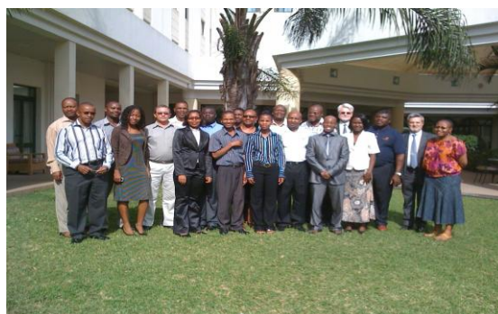
Participants to the ESC –EU Workshop in Maputo pose for a group photo.

Members felt the workshop period (3 days) was too short, given the amount of information that was to be covered. A follow-up workshop on SEA was therefore suggested. Participants expressed the need to make a presentation to the SAPP MANCO for their support and commitments on the SEA in all SAPP plans and programmes.