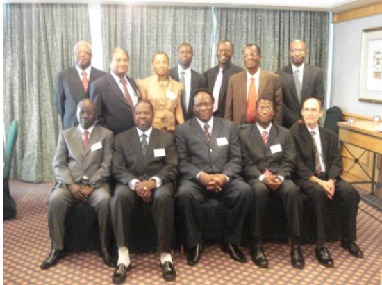
Delegates to the meeting posing for a group photo

EAPP, PEAC, SAPP and WAPP), AFREC and UPDEA.