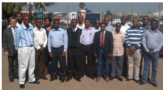
Some of the participants at the 5 th workshop on Transmission Planning

The 5 th workshop under the SAPP EU capacity building programme took place in Johannesburg, South Africa, from 14 to 16 April 2010. The workshop target members of the SAPP Planning Sub-Committee and focused on transmission system planning.