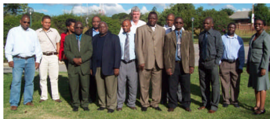
MSC delegates at the 5 th MSC meetings in Harare, Zimbabwe

and market guidelines development and mapped a way forward on these critical issues for the market.