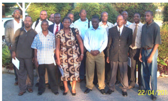
Some of the delegates at the Task Force meeting on system disturbances

The 5 th meeting of the Task Force on system disturbances was held in Harare, Zimbabwe, from 22 to 23 April 2010. The objective of the meeting was to consolidate the findings of the various system disturbances that occurred in 2008. The draft reports and preliminary recommendations were presented and discussed at the meeting. The Task Force is in the process of compiling the final report of the project which will be presented to the Operating Sub-Committee for adoption and approval. The Task Force has however urged members to implement the preliminary recommendations.