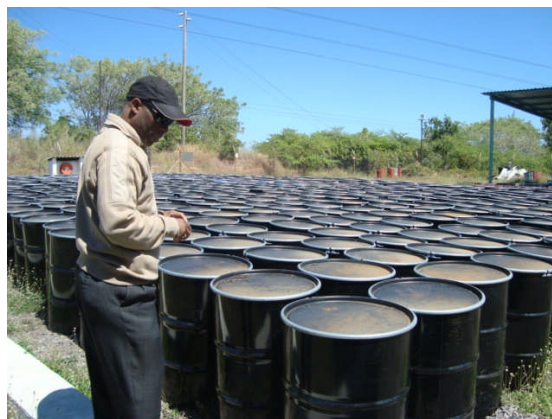
ESC Member from EDM viewing the United Nations approved drums containing PCB contaminated material at Siavonga, Zambia