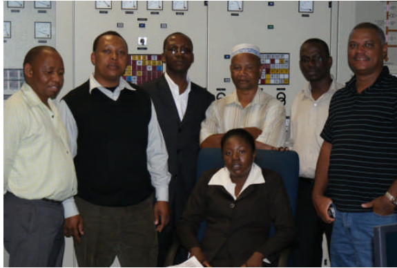
Delegates attending the TWG Meeting in Swaziland

in the different countries and existing links will complement the project and its completion will result in a complete network for SAPP. The installation of fibre between Zambia and Namibia will be an advantage to SAPP because it will link up the three host control areas and can be used as a standby when the telecommunications project has been implemented.