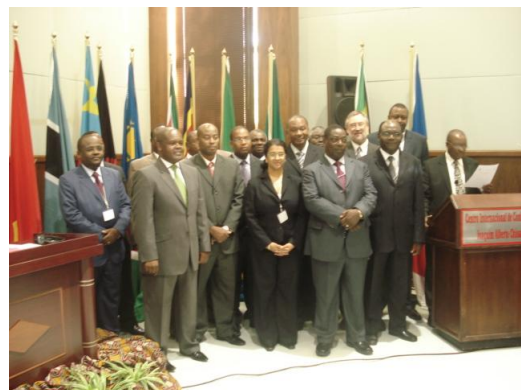
SAPP Executive Committee members pose for a photo after signing the FIFA 2010 Pledge to support Eskom

The initiative is part of Eskom's plans to ensure the reliability of electricity supply for the 2009 Confederations Cup™ and the 2010 FIFA World Cup™. The pledge of solidarity among the Southern African countries will be backed by commercial agreements to be negotiated and signed separately between SAPP members and Eskom and include initiatives that will ensure a targeted amount of power supplied, to be green power.