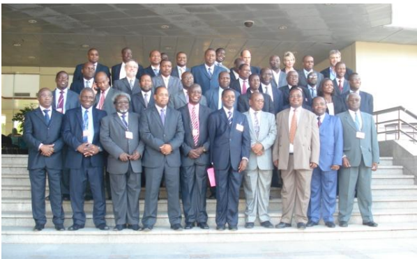
Members of the SAPP Executive Committee who attended the 26 th SAPP Executive Committee meeting in Maputo, Mozambique

The 26 th SAPP Executive Committee meeting took place in Maputo, Mozambique, on 27 April 2009. The aim of the meeting was to feed into the SADC Energy Ministers meeting that was planned for 29 April 2009 in Mozambique.